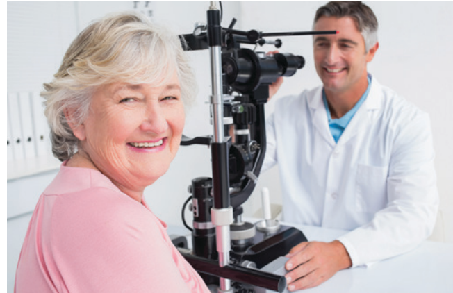
Not an actual AcellFX patient

The amniotic membrane is obtained and processed according to standards and/or regulations established by the American Association of Tissue Banks (AATB) and U.S. Food and Drug Administration (FDA).