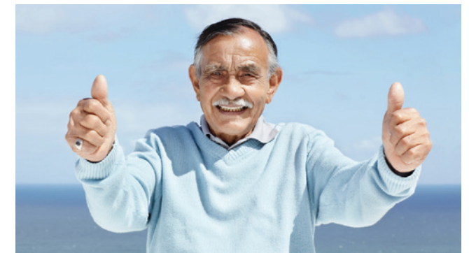
Not an actual AcellFX patient

Your eye needs help returning to a more healthy state. AcellFX is a natural choice to help the surface of your eye repair itself. AcellFX is quick and easy for your doctor to place in your eye. This amniotic membrane is tiny and comfortable.