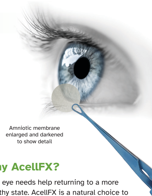
Amniotic membrane enlarged and darkened to show detail