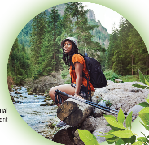
Not an actual AcellFX patient

This tiny membrane protects your eye as your eye surface repairs itself back to a healthy state. Your doctor will place it on your eye at your office visit. Your eye should have healthy absorption of AcellFX.